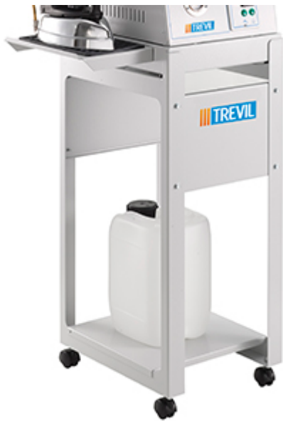
Refill tank included